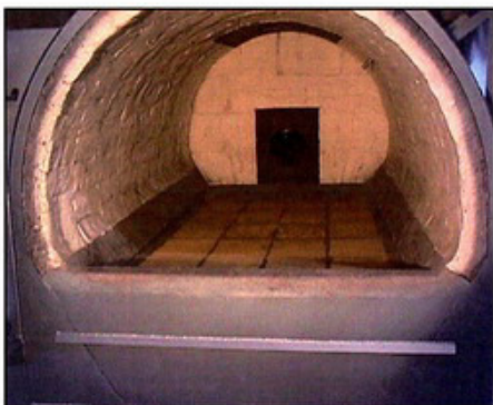
Interior Model CAC-400

Models Available With Dual Main Chambers With Breech Connection To A Common Secondary Chamber. Operation Of One Main Chamber Operating While The Other Chamber Is Cooling. Operation Offers Rapid Turn Around For Cremations. And Economy Of Operations Due To Secondary Chamber Being Common. Consult Factory For Additional Details For The DUPLEX "CAC" Models.